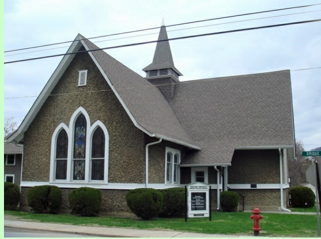
Dorland Memorial Presbyterian Church

25/70, Hot Springs, Phone: (423) 329-5466