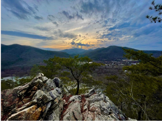
View from Lover's Leap Trail