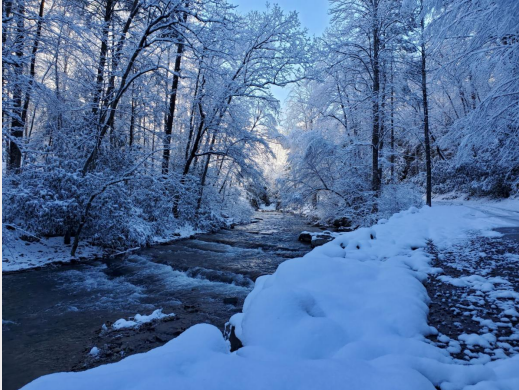
Snow on Paint Creek

Read 4 Activities to Enjoy in Winter Around Hot Springs, NC