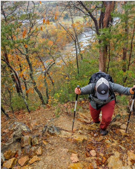
Fall Hiking up the Lover's Leap Trail, part of the Appalachian National Scenic Trail