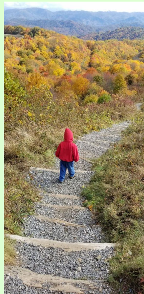
Max Patch in October

Views of the surrounding Bald and Walnut Mountains are absolutely impressive. The tower is near the AT and is open for the public to enjoy