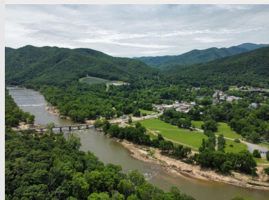
Photo from a recent rafting trip.

How we look today