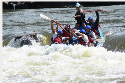
French Broad Whitewater on Section 9.

There are 4 local outfitters that can get you set up for an exciting whitewater adventure or relaxing float trip in an inflatable kayak or tube. Contact one of these friendly companies and get the fun started.