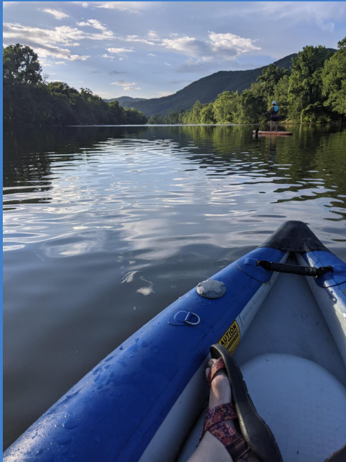
Floating down the French Broad River near Hot Springs

After a busy springtime, a little time near the water will get you into that relaxed summertime mood.