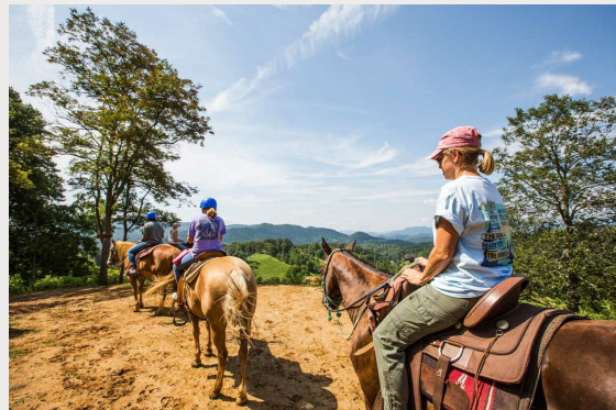
Horseback Riding with views at Sandy Bottom Trail Rides

Guided Hikes, Gear Rentals and Bunkhouse Lodging in town on the AT.