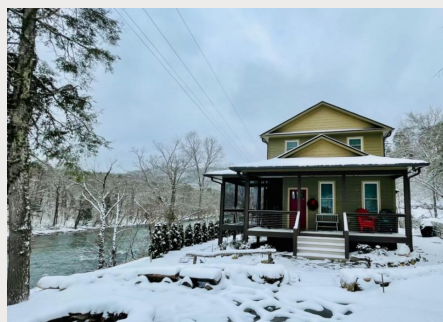
Red Gate Cottage on the French Broad River