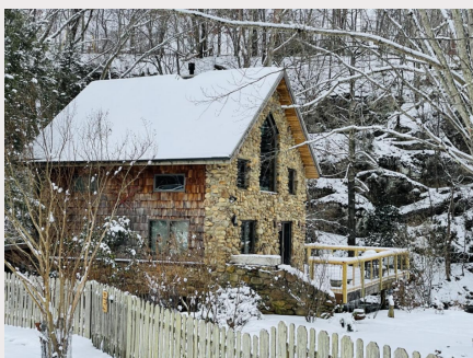
Stone Cottage on Spring Creek